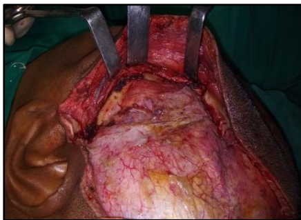
Figure No. 1: Four-point mini-fixation

And a four-point mini-fixation was done at Zygomatico-frontal suture, infra-orbital rim, Zygomatic buttress, and zygomatic arch ( Fig. 4 ). After that, the mandibular vestibular incision